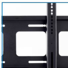
Wide range of VESA mounting holes