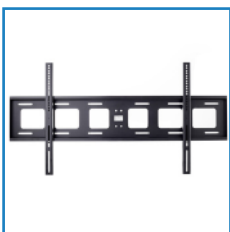
Minimalist design and functionality