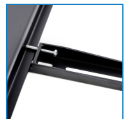
Screen protection against falling