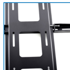
Short screen distance from the wall: only 42 mm